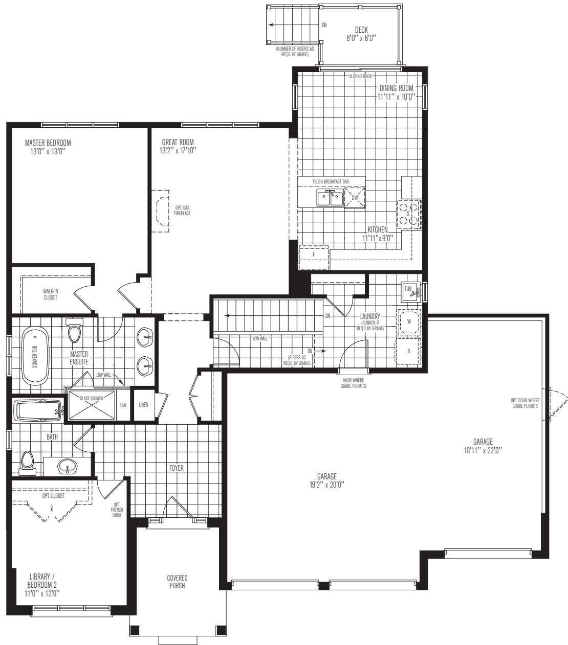
GROUND FLOOR | ELEVATION A